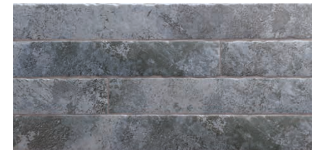
CEMENT BRICK JEANS 7 x 60 (G 77) 3" x 24" m 2