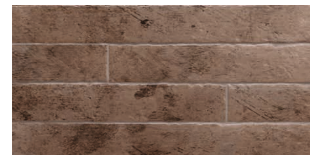
CEMENT BRICK BROWN 7 x 60 (G 77) 3" x 24" m 2