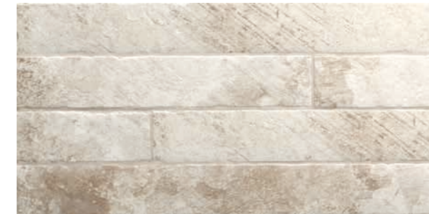
CEMENT BRICK WHITE 7 x 60 (G 77) 3" x 24" m 2