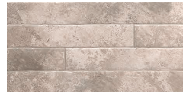
CEMENT BRICK BEIGE 7 x 60 (G 77) 3" x 24" m 2