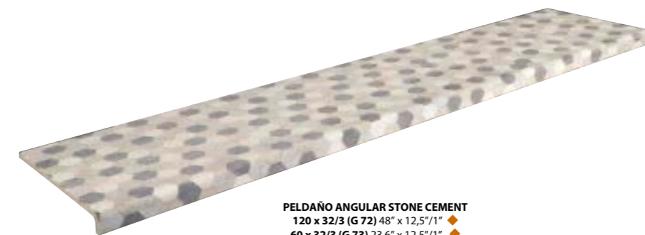
PELDAÑO ANGULAR STONE CEMENT 120 x 32/3 (G 72) 48" x 12,5"/1" ♦ 60 x 32/3 (G 73) 23,6" x 12,5"/1" ♦