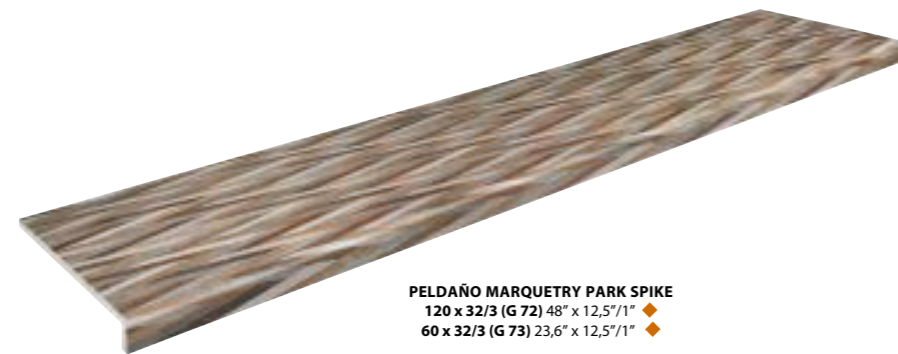
PELDAÑO MARQUETRY PARK SPIKE 120 x 32/3 (G 72) 48" x 12,5"/1" ♦ 60 x 32/3 (G 73) 23,6" x 12,5"/1" ♦